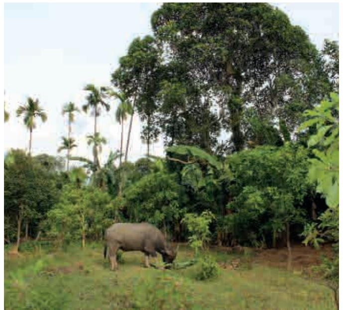
Keeping livestock, as in this home garden in Vietnam, can provide animal protein to families that could not otherwise afford it.

Agricultural extension services can thus play a crucial role in helping households with home gardens, introducing them to new techniques and providing information about different species' needs (water, light, soil and nutrient requirements), how to combine and layer species for optimal results, how to introduce animals, etc. In many places, however, home gardens are not recognized as part of agricultural systems and thus are not included in outreach efforts; changing that mindset should be a policy priority. Research has also highlighted the importance of combining agricultural education and technical support with health and nutrition education. Different fruits and vegetables provide different vitamins, minerals and micro-nutrients; when households understand their nutritional