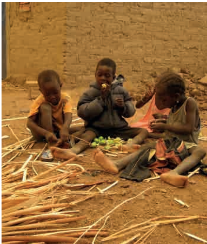
Children in the village of Bonogo, in Burkina Faso, eat green mangoes from a home garden tree.

seasonally, keeping a large number of crop, tree and animal species can help ensure a steady supply of food. Being able to harvest fuelwood in the garden has also been shown to be important, as available cooking fuels are often low-quality and increasingly scarce. 5