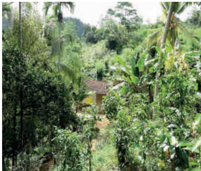
A wet-zone garden in Sri Lanka, where multi-layered edible gardens are a centuries-old tradition.

Home gardens come in many different forms, depending both on gardeners' own choices, and on external conditions: local climate, soil quality, culturally defined dietary and agricultural practices, and access to land, water, seeds, fertilizer, tools and other key resources. Many households have simple vegetable gardens with mostly annual crops, perhaps with ornamentals or trees on the margins. Others, especially in the tropics, build dense, multi-layered landscapes with trees, shrubs, vines and shade-tolerant perennials; one study in Oaxaca, Mexico, found 87% of home gardens had at least four vertical layers. 3 Gardens can also vary dramatically in terms of biodiversity: some include just a few favoured crops, while others include dozens of species, and also livestock or a small fish pond.