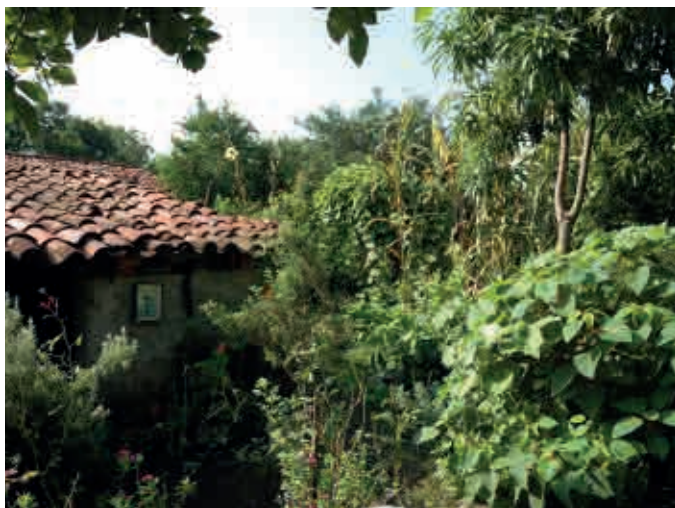
A typical patio in Jala, Nayarit, on Mexico's Pacific coast, with maize growing alongside fruit trees, herbs, chillies, and flowers.

comparative studies and literature reviews suggest that is very hard to generalize; conditions vary too much across locations. Even the well-studied subject of land tenure reform requires further research, to test the viability of different approaches and compare the pros and cons of promoting home gardens vs. community gardens, for example.