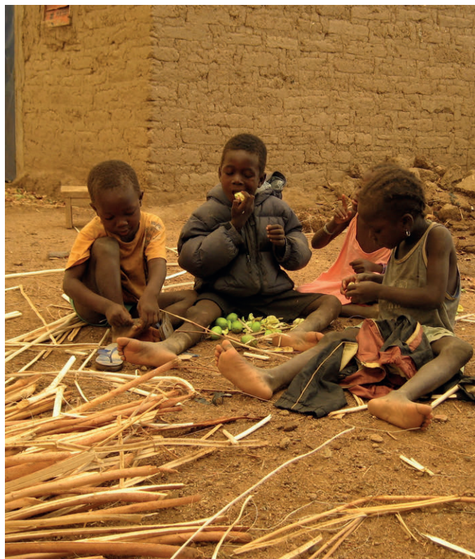
Children in the village of Bonogo, in Burkina Faso, eat green mangoes from a home garden tree.

seasonally, keeping a large number of crop, tree and animal species can help ensure a steady supply of food. Being able to harvest fuelwood in the garden has also been shown to be important, as available cooking fuels are often low-quality and increasingly scarce. 5