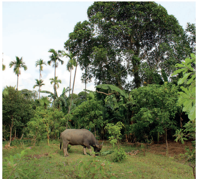
Keeping livestock, as in this home garden in Vietnam, can provide animal protein to families that could not otherwise afford it.

Agricultural extension services can thus play a crucial role in helping households with home gardens, introducing them to new techniques and providing information about different species' needs (water, light, soil and nutrient requirements), how to combine and layer species for optimal results, how to introduce animals, etc. In many places, however, home gardens are not recognized as part of agricultural systems and thus are not included in outreach efforts; changing that mindset should be a policy priority. Research has also highlighted the importance of combining agricultural education and technical support with health and nutrition education. Different fruits and vegetables provide different vitamins, minerals and micro-nutrients; when households understand their nutritional