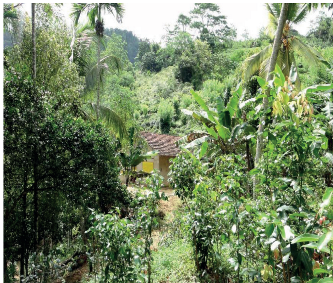
A wet-zone garden in Sri Lanka, where multi-layered edible gardens are a centuries-old tradition.

Home gardens come in many different forms, depending both on gardeners' own choices, and on external conditions: local climate, soil quality, culturally defined dietary and agricultural practices, and access to land, water, seeds, fertilizer, tools and other key resources. Many households have simple vegetable gardens with mostly annual crops, perhaps with ornamentals or trees on the margins. Others, especially in the tropics, build dense, multi-layered landscapes with trees, shrubs, vines and shade-tolerant perennials; one study in Oaxaca, Mexico, found 87% of home gardens had at least four vertical layers. 3 Gardens can also vary dramatically in terms of biodiversity: some include just a few favoured crops, while others include dozens of species, and also livestock or a small fish pond.