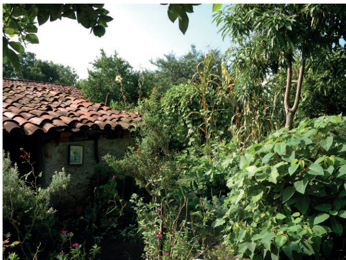
A typical patio in Jala, Nayarit, on Mexico's Pacific coast, with maize growing alongside fruit trees, herbs, chillies, and flowers.

comparative studies and literature reviews suggest that is very hard to generalize; conditions vary too much across locations. Even the well-studied subject of land tenure reform requires further research, to test the viability of different approaches and compare the pros and cons of promoting home gardens vs. community gardens, for example.