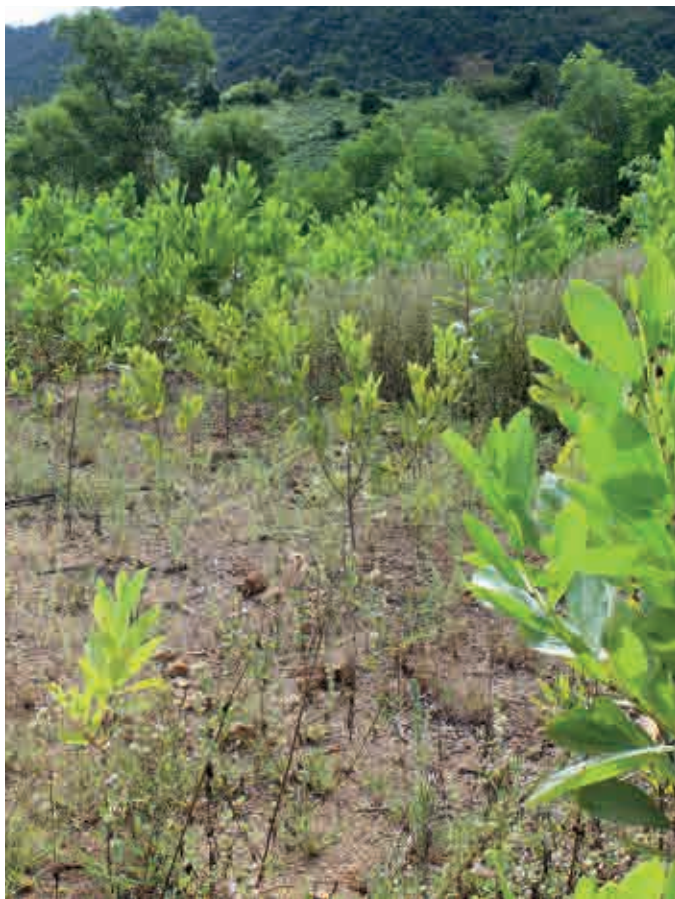
A fledgling “forest garden” grows on degraded land in Vietnam.

converted it into agroforestry systems, or “forest gardens”, with a combination of tree plantations, grown for a profit, and agricultural crops for household consumption and for sale. Rural livelihoods have improved in many places as a result, in terms of both cash flow and resilience to stresses such as climate change.