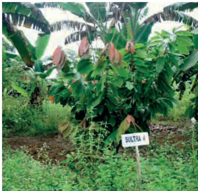
A cacao agroforestry system demonstration at the Cacao Research Sub Station in Sulawesi, Indonesia.

In 2011, the Global Partnership on Forest Landscape Restoration published a map of forest restoration opportunities around the world: 2 billion hectares from northern Canada, to sub-Saharan Africa. Up to half a billion acres, the project found, would be suitable for wide-scale restoration of closed forests; the remaining 1.5 billion hectares, it showed, were best-suited for "mosaic restoration", in which forests and