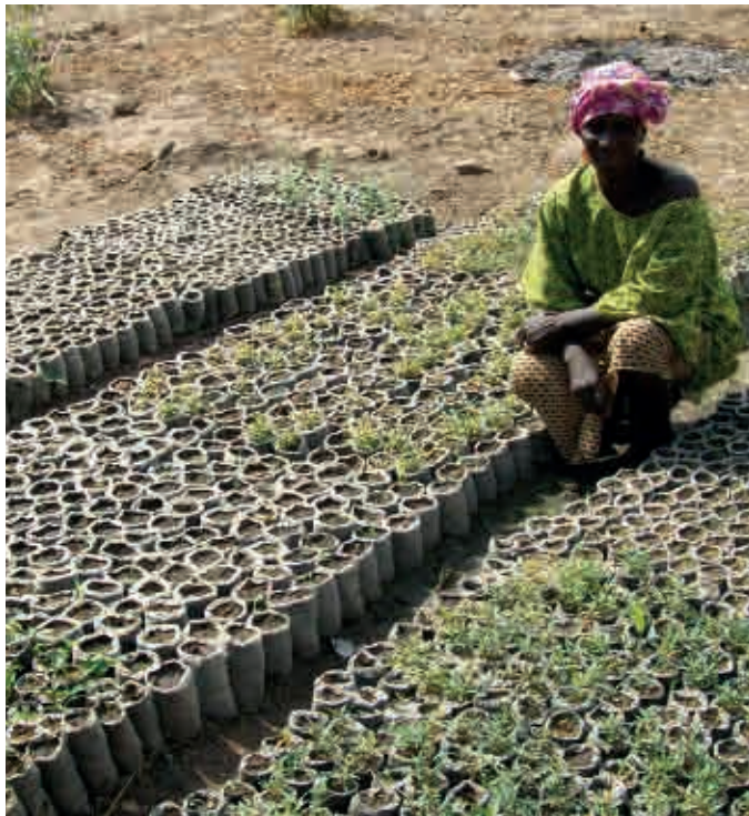
Tree seedlings in the Bendougou Nursery, in Mali, where agroforestry strategies have been widely implemented on cropland.

A more beneficial alternative, from an ecosystems perspective, is to create a multi-functional land use system. For example, native tree species can be planted together with shade-tolerant agricultural cash crops – such as coffee, cocoa or cardamom – or non-timber forest products such as rattans or medicinal plants. Such an approach also ensures economic viability and may improve biodiversity, ecosystem services and carbon capture, benefiting local communities and society as a whole. 11