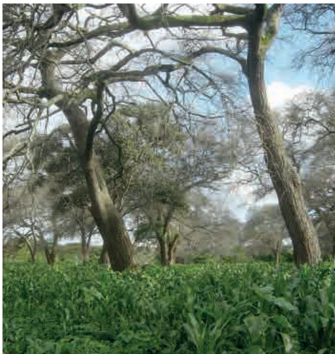
Maize grows under a canopy of Faidherbia albida , a nitrogen-fixing tree species that has been successfully used across Africa.