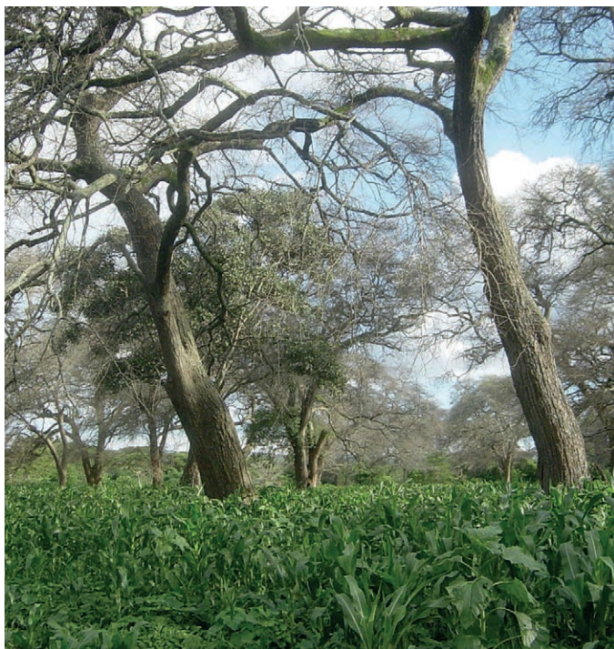
Maize grows under a canopy of Faidherbia albida , a nitrogen-fixing tree species that has been successfully used across Africa.