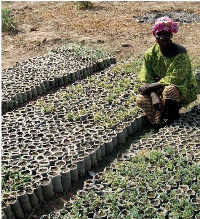
Tree seedlings in the Bendougou Nursery, in Mali, where agroforestry strategies have been widely implemented on cropland.

A more beneficial alternative, from an ecosystems perspective, is to create a multi-functional land use system. For example, native tree species can be planted together with shade-tolerant agricultural cash crops – such as coffee, cocoa or cardamom – or non-timber forest products such as rattans or medicinal plants. Such an approach also ensures economic viability and may improve biodiversity, ecosystem services and carbon capture, benefiting local communities and society as a whole. 11