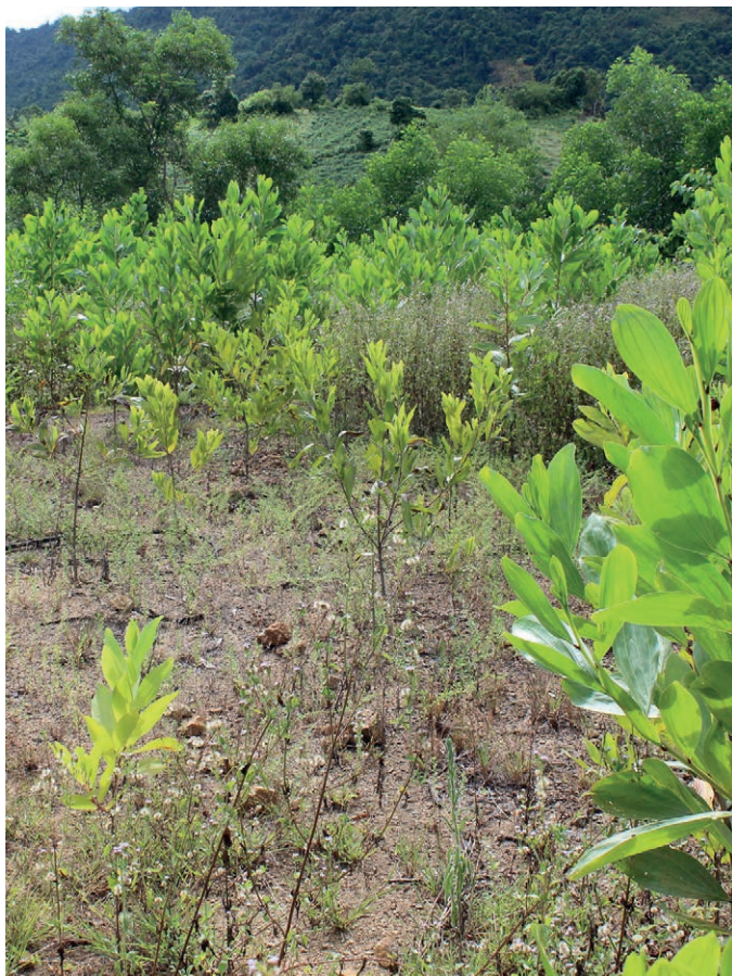
A fledgling “forest garden” grows on degraded land in Vietnam.

converted it into agroforestry systems, or “forest gardens”, with a combination of tree plantations, grown for a profit, and agricultural crops for household consumption and for sale. Rural livelihoods have improved in many places as a result, in terms of both cash flow and resilience to stresses such as climate change.