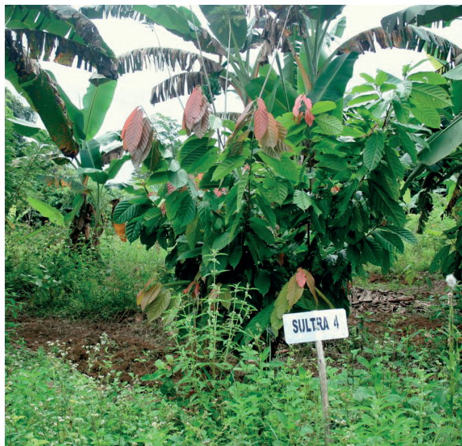
A cacao agroforestry system demonstration at the Cacao Research Sub Station in Sulawesi, Indonesia.

In 2011, the Global Partnership on Forest Landscape Restoration published a map of forest restoration opportunities around the world: 2 billion hectares from northern Canada, to sub-Saharan Africa. Up to half a billion acres, the project found, would be suitable for wide-scale restoration of closed forests; the remaining 1.5 billion hectares, it showed, were best-suited for "mosaic restoration", in which forests and