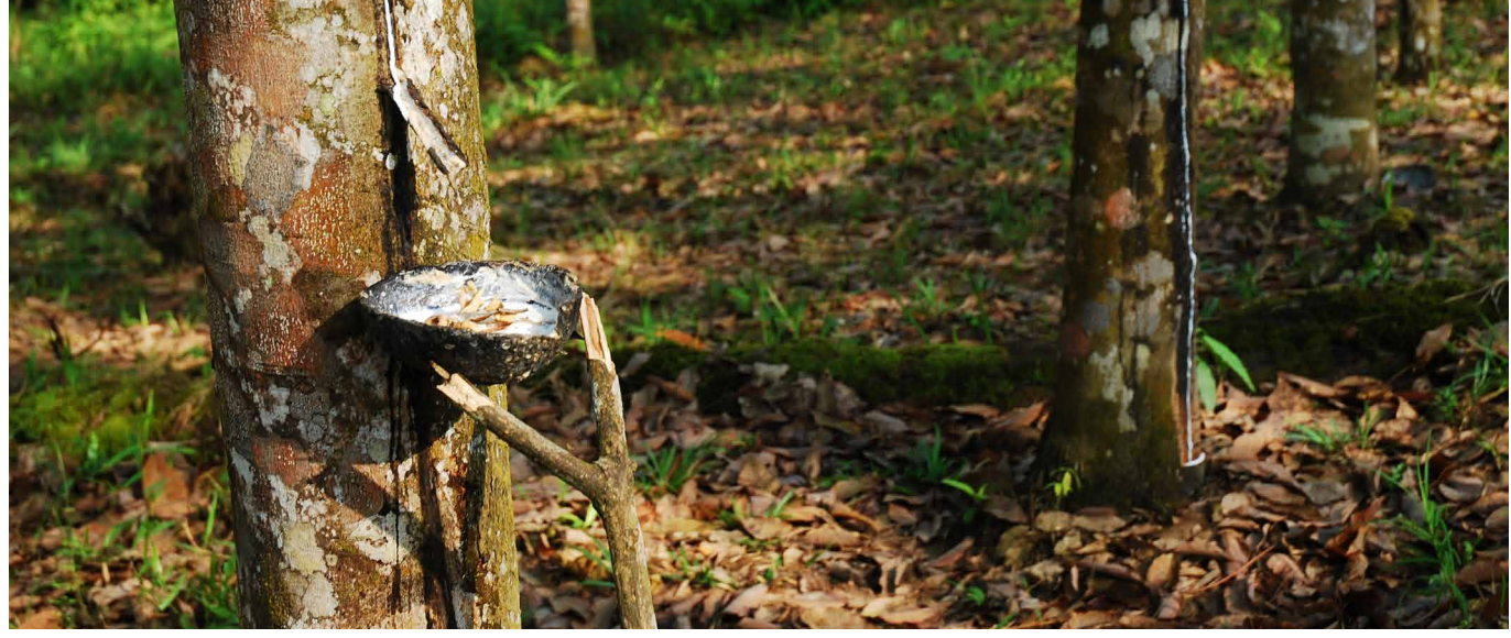
Rubber tree plantation in Indonesia.

Current evidence does not support recommendations to exempt key forest risk-commodities, such as maize or natural rubber, from EU legislation on imported deforestation.