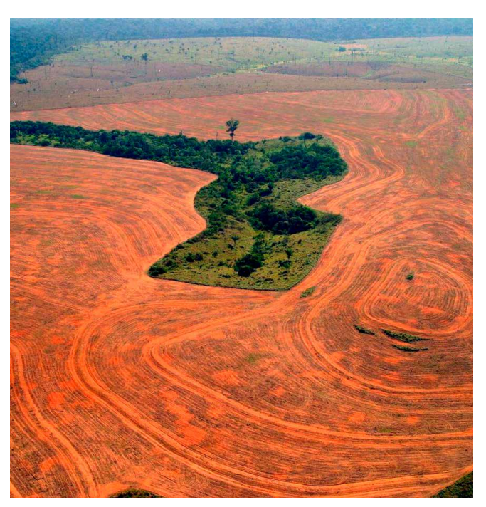
Aereal view of an area deforestated by soybean farmers in Novo Progreso, Para, Brazil, September, 2004.

We welcome that the draft impact assessment recognizes the need to regularly review and amend the product scope, in order to reflect changes in deforestation drivers. However, based on the available evidence – and knowing its limitations and caveats – we do not think that there are strong reasons at present for a recommendation to exempt any of the assessed commodities from the initial scope of the forthcoming EU legislative proposal.