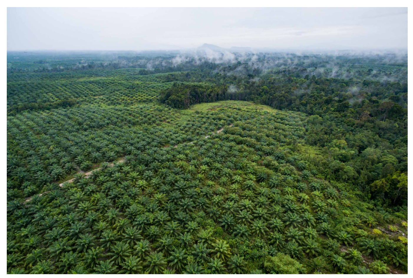
Aerial footage of palm oil and the forest in Sentabai Village, West Kalimantan. 2017.

which implies that the conclusion to exempt maize and rubber is misguided. Most importantly, there is a mismatch between the products included when estimating embodied deforestation and the associated economic value. We quantify deforestation embodied in EU imports using a trade model that excludes highly processed products; when it comes to rubber, for instance, the deforestation embodied in imports only accounts for trade in unprocessed natural rubber. In contrast, the EU Commission in its draft impact assessment calculates the value of rubber imports using a trade code, which encompasses a broad range of rubber products, not restricted to natural rubber, but also including reclaimed and synthetic rubber. In addition, because many of these products have gone through processing steps that add economic value, the value of EU rubber imports becomes very large compared to that of other assessed commodities. Conversely, for other commodities, such as soybeans and cocoa, the products included in the monetary estimate are more restrictive than those covered in the assessment of traded deforestation (seemingly excluding the substantial EU imports of soybean cake for feed, reported under trade code HS2304).