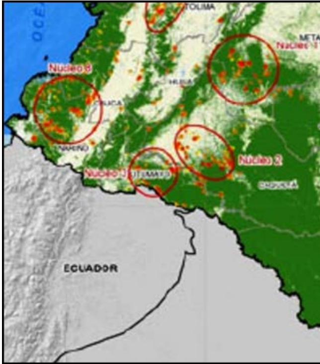
Deforestation hotspots in Southern Colombia; IDEAM 2014