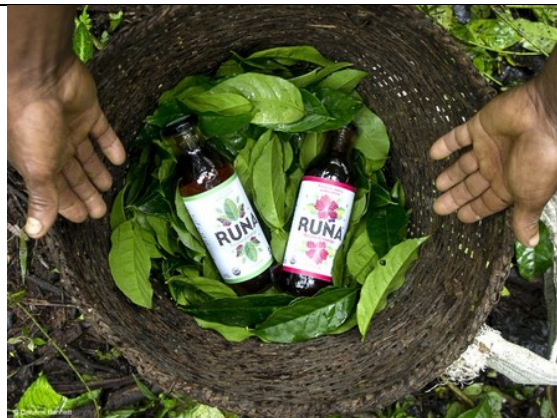
Harvested guayusa leaves and the final product