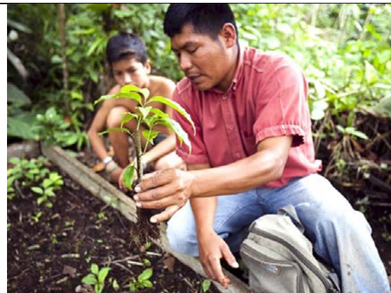
Planting guayusa in a nursery before the plants are given to farmers