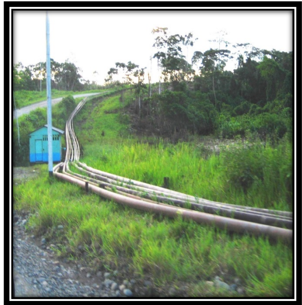
Photo showing oil pipelines next to a gravel road in the Orellana province. (Photo: Torsten Krause, July 2011)

Oil exploration and production in the Amazon show no signs of slowing down or ceasing in the near future, particularly in the light of a planned construction of a new refinery (Martin, 2011a, Martin, 2011b). Indigenous groups and organizations in Ecuador and beyond strongly oppose oil development on their territories (CONAIE et al., 2012)