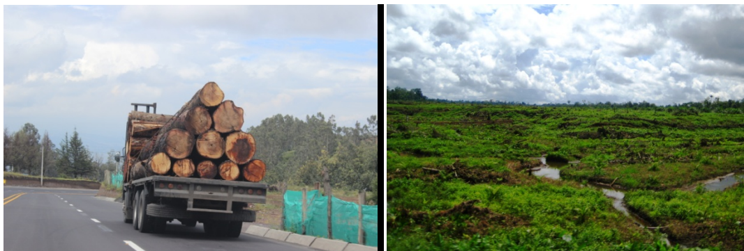
On the way to Quito - Truck with Timber from the Amazon

From a political perspective, the governments of Ecuador and Colombia are both pushing for extractive industries, foremost oil exploitation and mining, thus further signing the fate of the forest and their inhabitants.